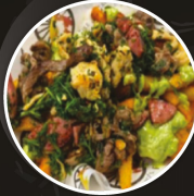
Meat Lover's Fries

Layer of fries with grilled sausage, homemade gaucho sauce and provolone cheese. (Add grilled onions). $10.99