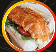
Grilled Cheese Sandwich

Special homemade seasoned diced chicken, with lettuce, tomatoes, provolone cheese and mayonnaise. $10.99 - With Fries $14.49