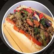
The Ultimate Brazilian Sandwich

Made with French bread, picanha (the center part of top sirloin), grilled onions, mayonnaise, Provolone melted cheese, and homemade vinaigrette sauce. $10.99 - With Fries $14.99