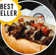
Brazilian Steak Sandwich

Made with French bread, picanha (the center part of top sirloin), grilled onions, mayonnaise, Provolone melted cheese, and homemade vinaigrette sauce. $10.99 - With Fries $14.99