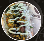
Meat Lovers Sandwich

Crispy Breaded Chicken, Tomato, Cabbage, Grilled Onions, Gaucho sauce, and Tartar Sauce $12.99 - With Fries $16.99