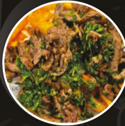
Grilled Beef Chimichurri

Layer of fries with homemade seasoned grilled steak, homemade chimichurri sauce and provolone cheese on top. (Add grilled onions). $11.99